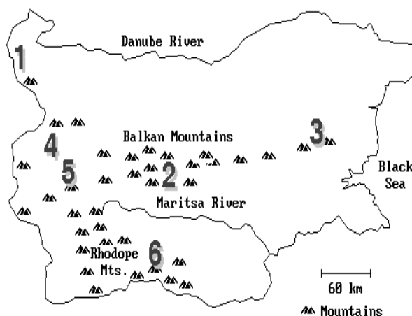
Fig. 1. Geographic situation of the epigenetically studied populations of the Fat dormouse ( Glis glis L.) from Bulgaria: 1 - West Stara planina, 2 - Central Balkan, 3- East Stara planina, 4- West Fore-Balkan, 5-Vitosha Mountain, 6 - Rhodope Mountain

The appearance of 12 cranial traits representing orifices of nerves and blood vessels was recorded. These traits were chosen from the ones used by Berry (3), Berry and Searle (4) and Hedges (5) for rodents and were deduced from the left side of the skull. Their status was recorded as follows: 1. Fenestra flocculy - present; 2. Preorbital foramen - double; 3. Anterior frontal foramen - present; 4. Posterior frontal foramen - present; 5. Maxillary foramen I - present; 6. Maxillary foramen I - present; 7. Foramen sphenoidale medim - present; 8. Processus pterygoideus - present; 9. Foramen ovale - double; 10. Foramen hypoglossi - double; 11. Foramen basioccipitale - present; 12. Foramen mental - double.